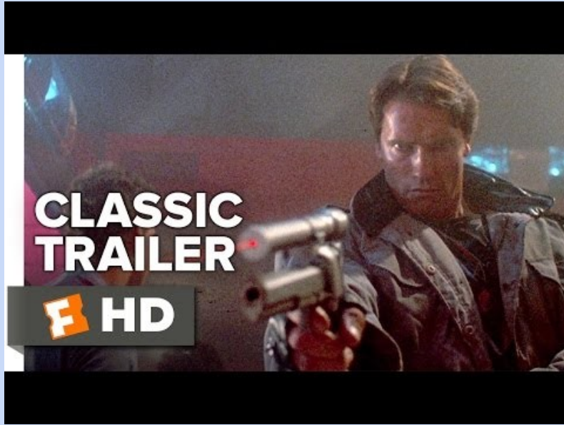
The Terminator (1984) - Trailer (HD) - You Tube