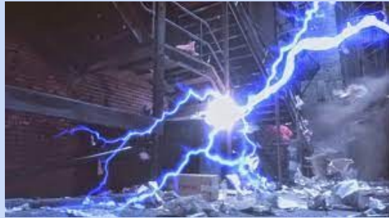
Film's world 1984